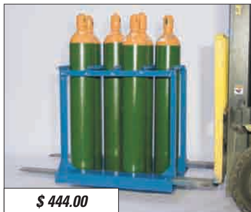
Bottom Lift Caddy holds a full 8 cylinders. Order No. K52-1180