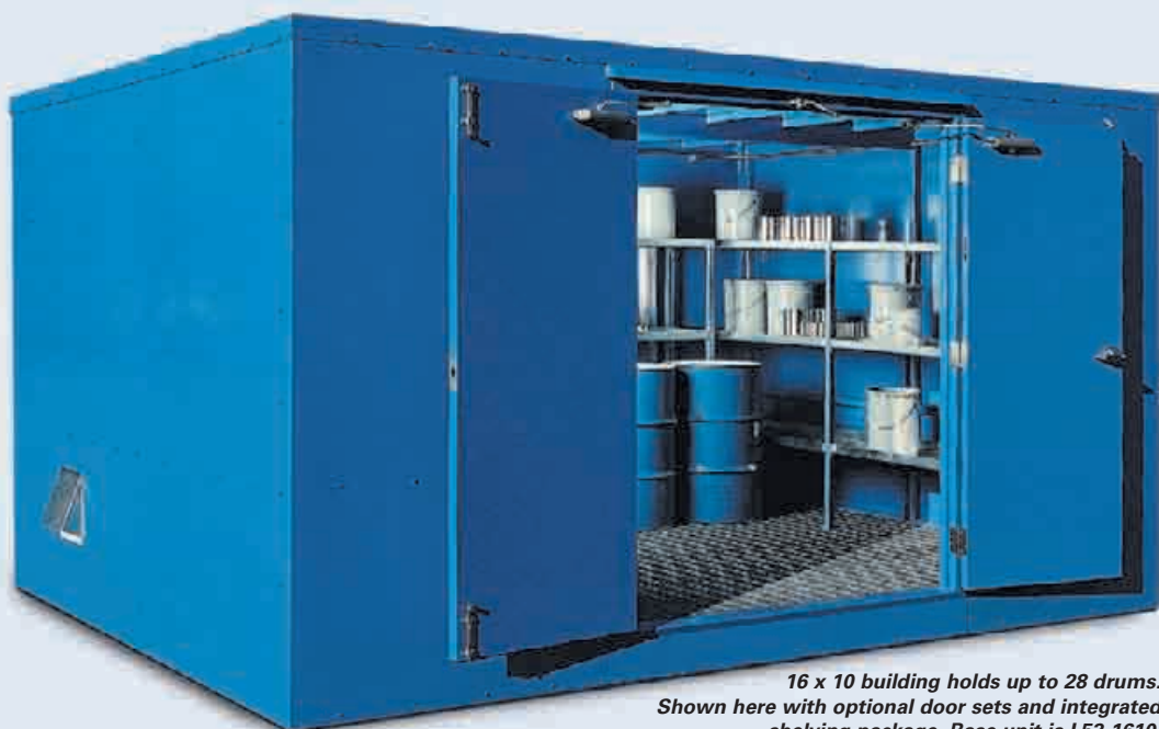
16 x 10 building holds up to 28 drums. Shown here with optional door sets and integrated shelving package. Base unit is L53-1610.