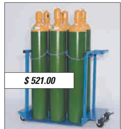
Supplied with heavy duty casters including swivel / braking on rear, the push caddy makes cylinder transport safe and easy. Order No. K52-1190