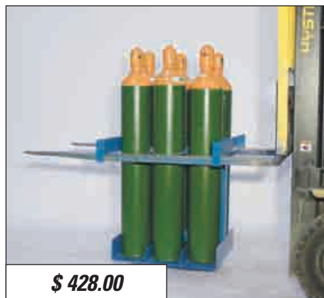
Top Lift design traps cylinders between forks for extra stability. Order No. K52-1170